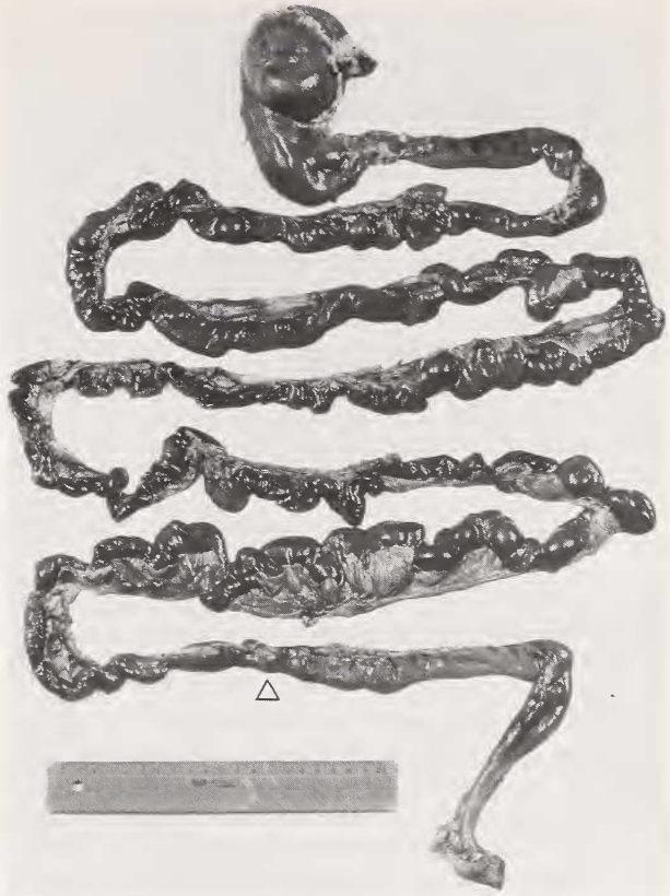
Fig. 1. Gut of a mature female badger weighing 8.5 kg, showing stomach, small intestine and colon. An arrow marks the beginning of the colon (the scale is 20 cm)

Figure 2 shows the surface areas of stomach, small intestine and colon plotted against body weight on logarithmic coordinates, for 80 mammals species including Meles meles . The data points for Meles meles represent the mean values from seven of the eleven animals included in Table 1: the remaining four animals were starved or damaged, and so were excluded from the analysis. Data for the 79 comparison species were provided by A. MAC-LARNON. The absolute gut quotient values for Meles meles are: stomach quotient, 1.1; small intestine quotient, 1.75; colon quotient, 0.40. Thus it can be concluded that the surface area of the stomach of the